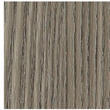
Antler 64761 LRV 18.4 V2 - Slight Variation