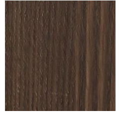
Clove 64740 LRV 7.7 V2 - Slight Variation