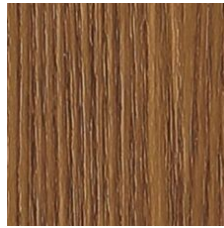
Ginger 64820 LRV 15.2 V2 - Slight Variation