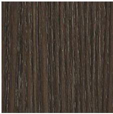
Chickory 64752 LRV 6.9 V2 - Slight Variation