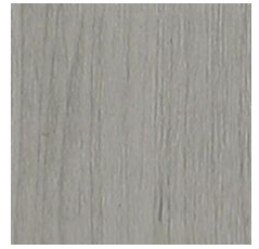
Weathered 64518 LRV 29.5 V2 - Slight Variation